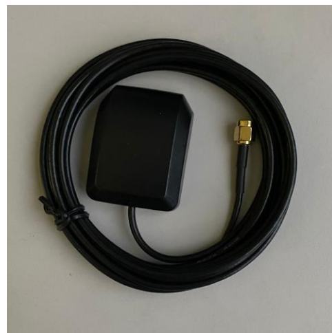
GPS External Active Antenna